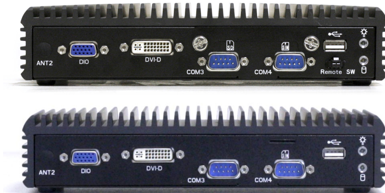
Front view EL1083 / EL1083-EC